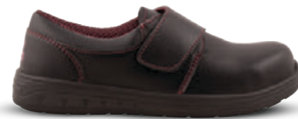
CODE R-974 | SIZES 2-8 ZARI Ladies safety shoe with Velcro strap