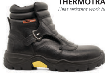
CODE R-5072 | SIZES 4-14 THERMOTRAK Heat resistant work boot