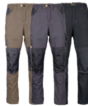
SIZES 28-48 TECH GEAR TROUSERS Ultra durable technical trousers

DESERT DUST, CODE R-TRDD GUN METAL, CODE R-TRGM RAVEN BLACK, CODE R-TRBK