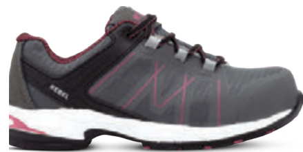
CODE R-941 | SIZES 2-8 LIGHT INDUSTRIAL Lightweight and stylish safety shoe