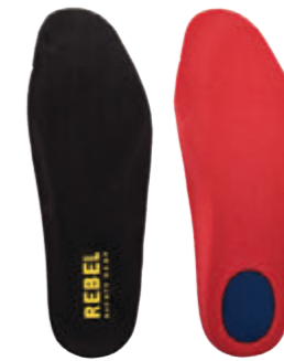
CODE REBFB-02 | SIZES 2-14 PLATINUM FOOTBED

Velcro adjustable strap and lightweight, unisex design | SRC anti-slip design, durable and flexible rubber sole