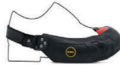
CODE R-VOS | SIZES 2-13+ OVERSHOE Unisex safety visitor overshoe