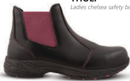
CODE R-940 | SIZES 2-8 THULI Ladies chelsea safety boot