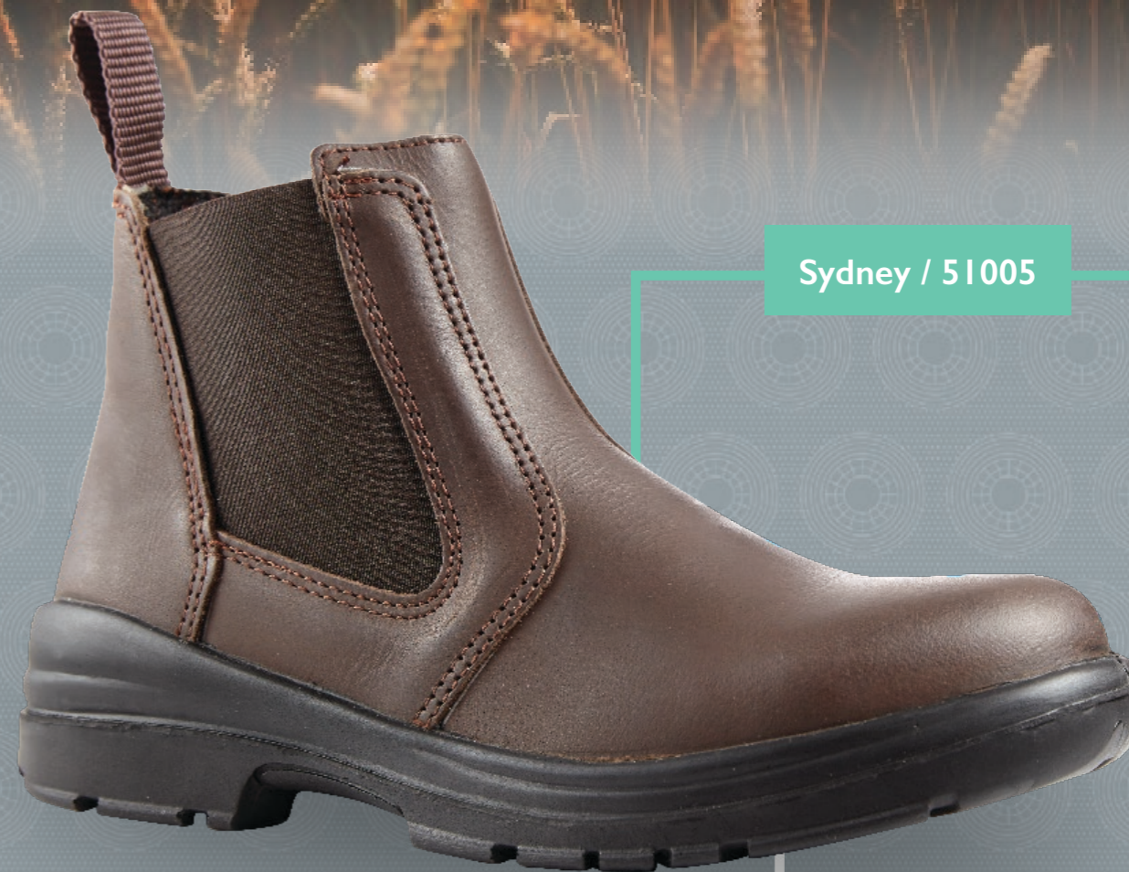
Sydney / 51005