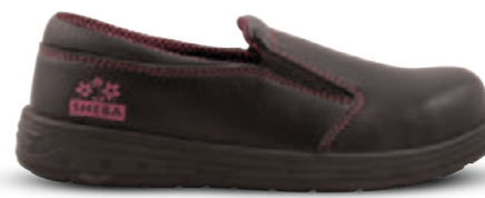
CODE R-683 | SIZES 2-8 KITO Ladies slip-on safety shoe