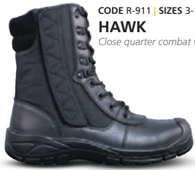
CODE R-911 | SIZES 3-15 HAWK Close quarter combat work boot