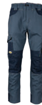
CODE R-TGAB | SIZES 28-48 TECH GEAR TROUSER – AIR FORCE BLUE Ultra durable technical trousers

Poly-cotton canvas is a cotton fabric with a high-density polyester thread weaved into it, making it easier to care for and more | Seven custom utility pockets