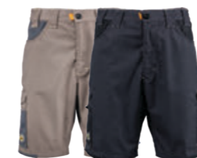
SIZES 28-48 TECH GEAR SHORTS Ultra durable technical trousers

DESERT DUST, CODE R-SHDD GUN METAL, CODE R-SHGM